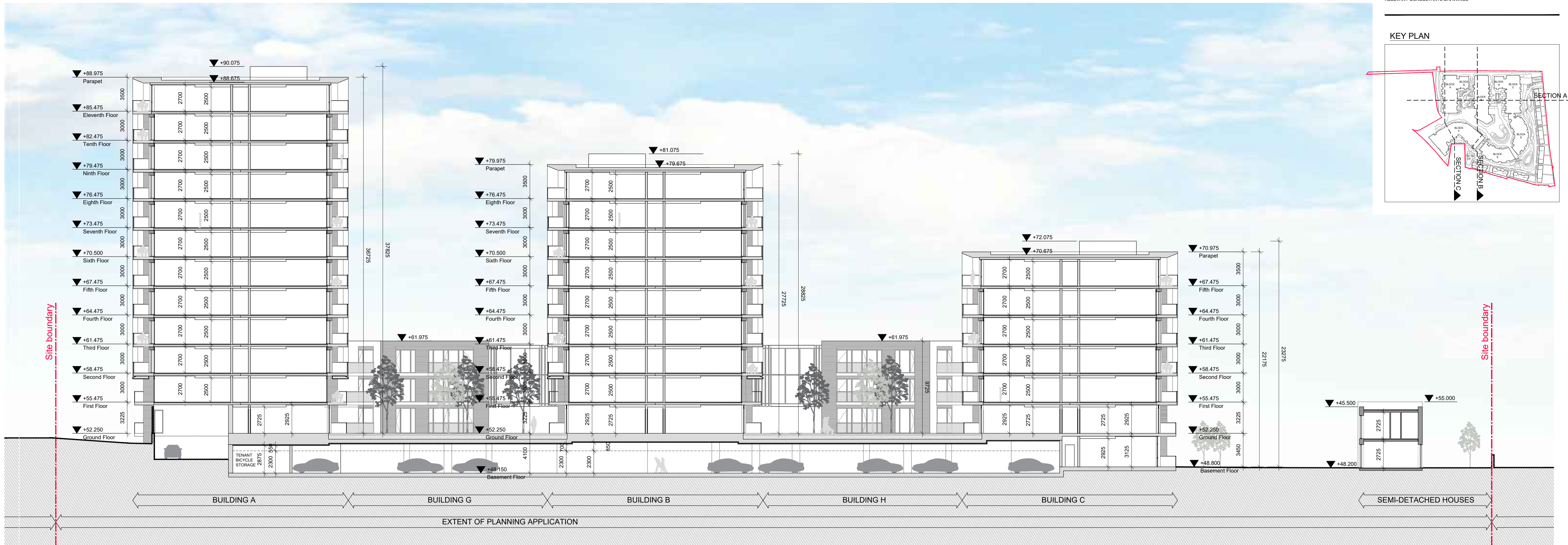
01 PROPOSED SECTION A PL3001 SCALE 1:200